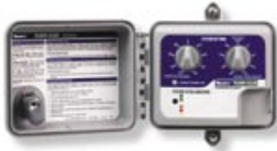
Flow-Clik Interface Panel

Automatically shuts down irrigation system if an overflow condition occurs