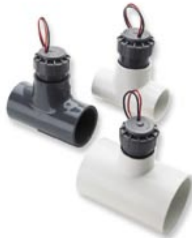
Flow-Clik Sensor and Body

The hazards of an over-flow situation know no economic boundaries. A high flow and the damage that can occur could just as easily take place on a simple residential system as it could on a top-of-the-line commercial system comprised of institutional-grade components. That's why Hunter has developed the Flow-Clik, an economical way to monitor and shut off the flow of any system—existing or new, large or small. A ruptured pipe or broken sprinkler that is left undetected can result in a substantial amount of damage. Plants and groundcover can be flooded, a slope can be eroded,