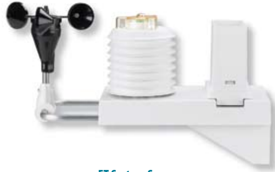
ET System Sensor (Shown with optional ET WIND)

T ake the guesswork out of residential irrigation scheduling, by tracking your local microclimate and automatically calculating a scientific irrigation program! The Hunter ET System is an easy-to-add-on accessory (for any Hunter controller that operates with a SmartPort® system) that measures key climatic conditions, and uses them to calculate your local Evapotranspiration (ET) factor. The ET is then downloaded into your irrigation controller to create an irrigation program that is just right for your sprinkler system, plants, and soil conditions. By taking into account the rate at