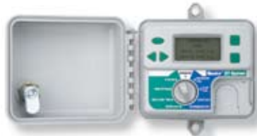
ET System Module

Gathers weather data on site, continuously calculates the ideal program for your landscape